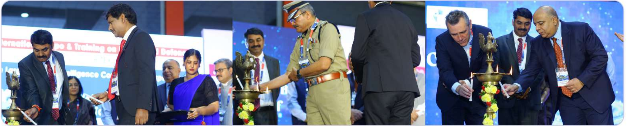
Scientific Adviser to Defense Minister Government of India Dr. G. Satheesh Reddy lightens the lamp and inaugurates the DIGIPOL 2023 in the presence of other dignitaries.