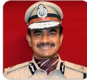
Sri C V Anand IPS Commissioner of Police - Hyderabad Government of Telangana