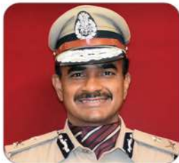
Sri C V Anand IPS Commissioner of Police - Hyderabad Government of Telangana