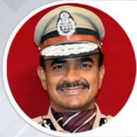
Shri C V Anand IPS

Commissioner of Police - Hyderabad, Government of Telangana